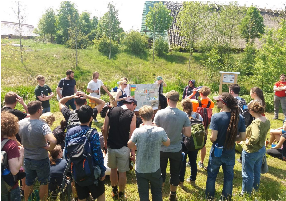
Figure 1: Field trip in the Lahn valley

On Sunday, the program started with the last oral presentations on Geoaerchology and Tectonics, erosion and climate in high mountainous areas. Afterwards, a new board was elected. The meeting ended with an evaluation of the conference (see feedback).